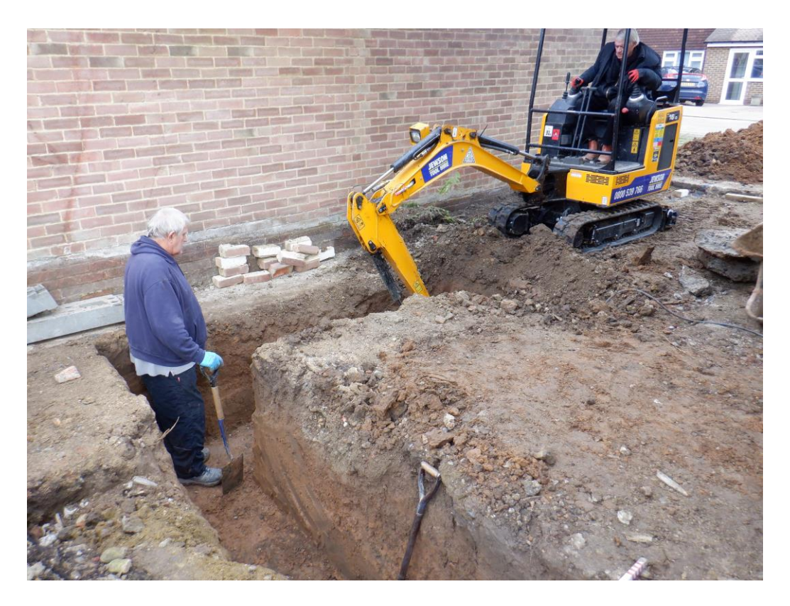
Plate 1. View of the site (looking N)