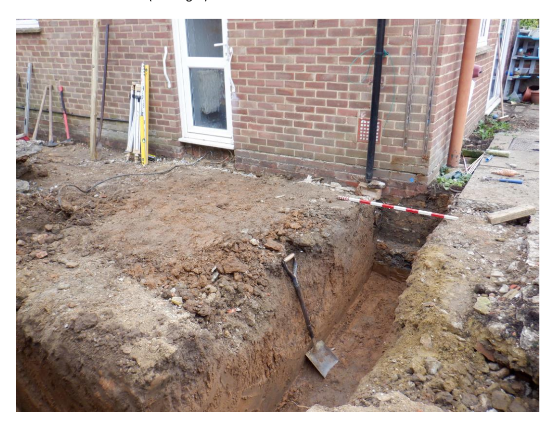
Plate 2. View of trenching in progress (looking E)