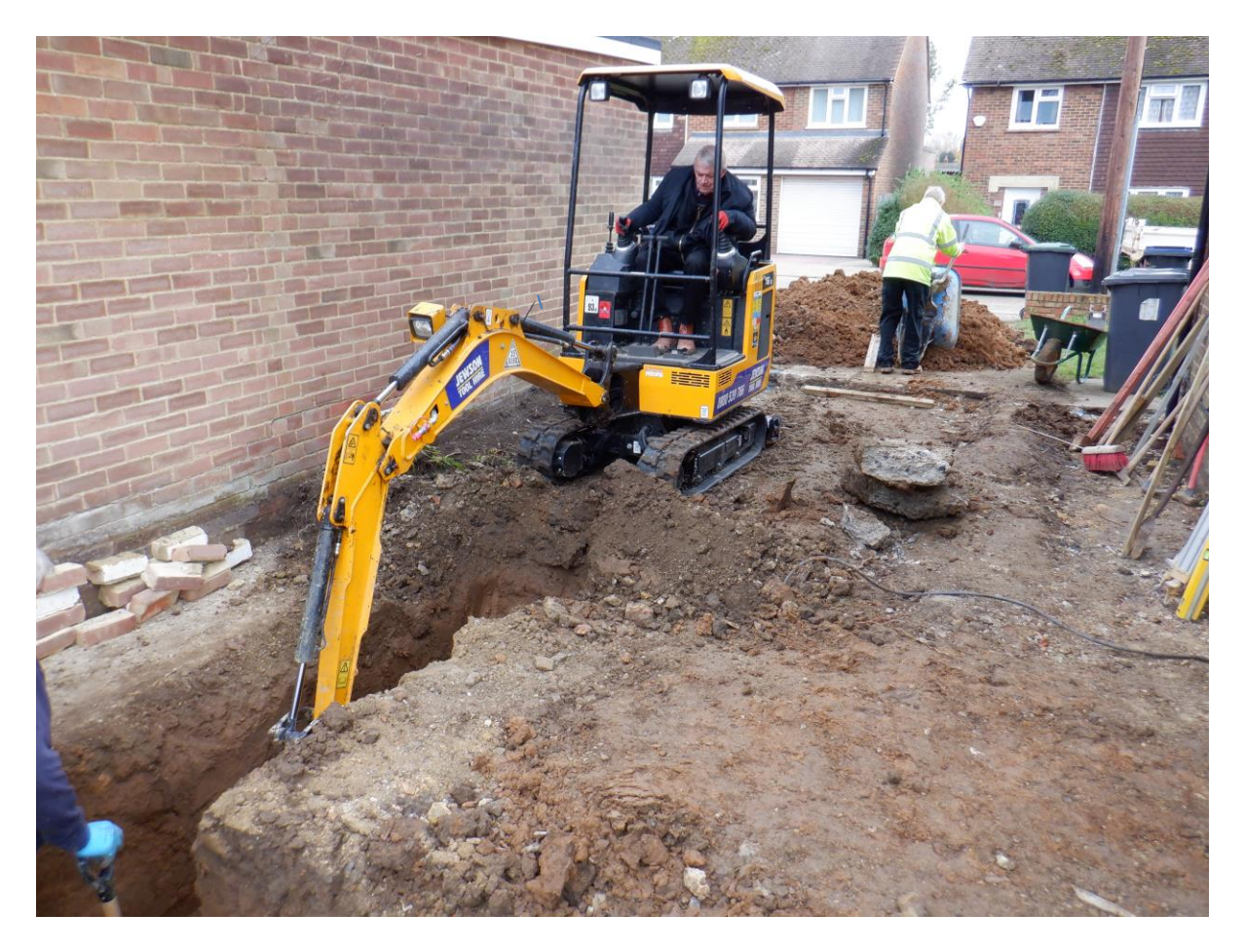
View 1. View of proposed development site