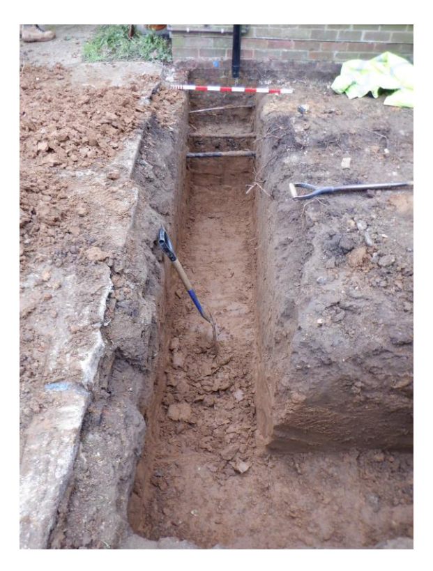
Plate 4. View of foundation trenches (looking SE)