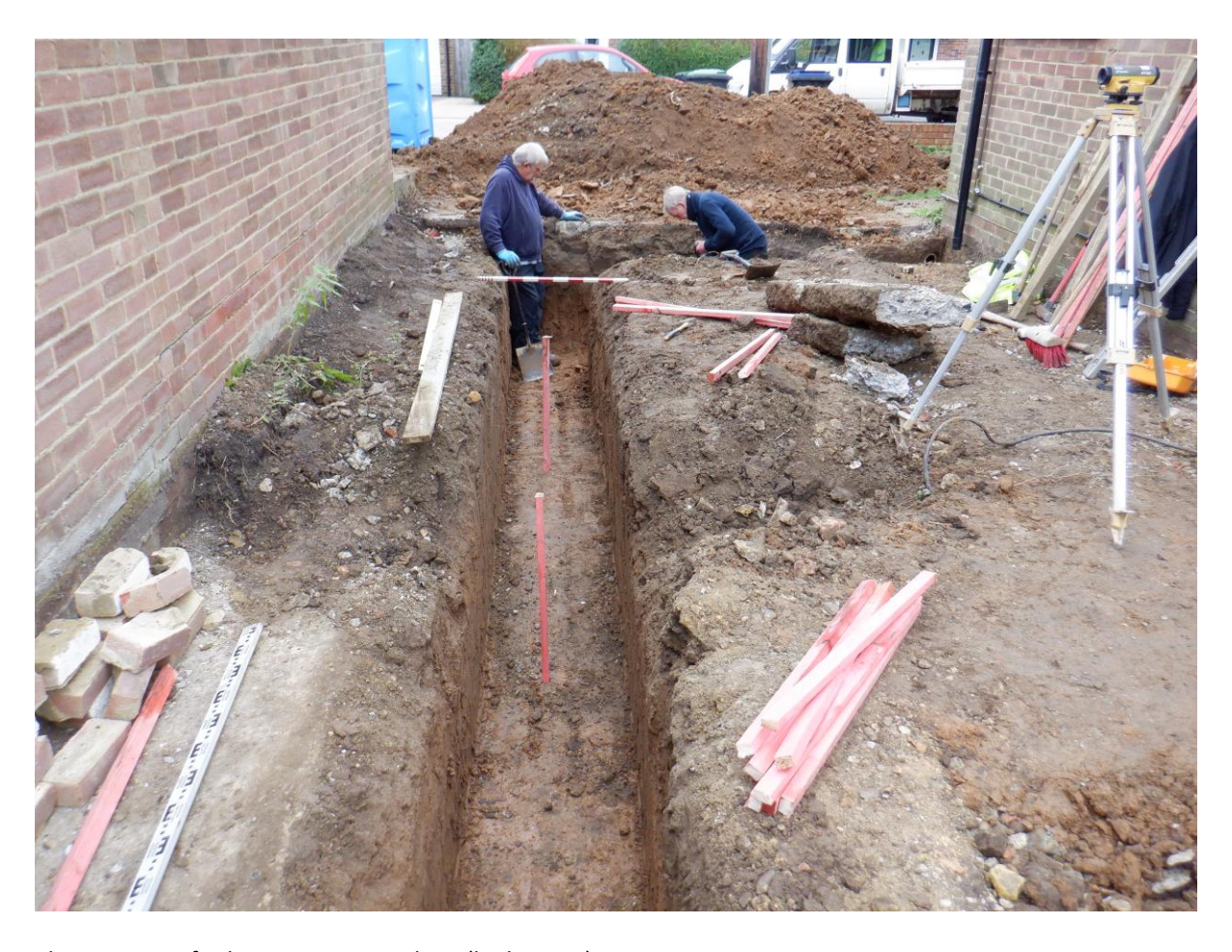
Plate 3. View of side extension trenching (looking NE)